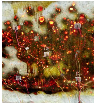
46 Minute Insulation