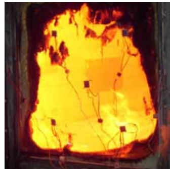
66 Minute Integrity