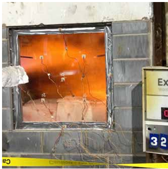
Hydrocarbon Fire 1 Minute